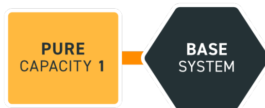
Figure 1. Diagram of system without renewable resources.

The capacity calculated is designated in Figure 1 as Pure Capacity 1.