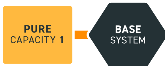
Figure 1. Diagram of system without renewable resources.

Next, a LOLE value for all wind generating resources will be determined, repeating the steps described previously. The Pure Capacity value calculated is designated in Figure 2 as Pure Capacity 2.