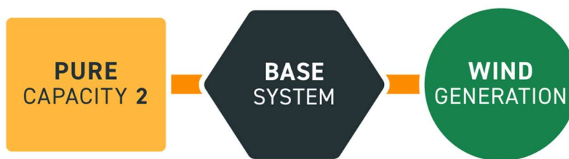
Figure 2. Diagram of system with renewable resources.

Next, a LOLE value for all wind generating resources will be determined, repeating the steps described previously. The Pure Capacity value calculated is designated in Figure 2 as Pure Capacity 2.