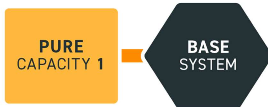
Figure 1. Diagram of system without renewable resources.

The capacity calculated is designated in Figure 1 as Pure Capacity 1.