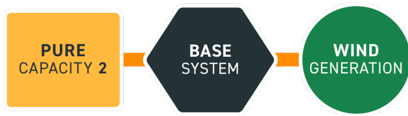
Figure 2. Diagram of system with renewable resources.

Next, a LOLE value for all wind generating resources will be determined, repeating the steps described previously. The Pure Capacity value calculated is designated in Figure 2 as Pure Capacity 2.