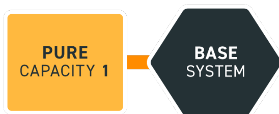
Figure 1. Diagram of system without renewable resources.

The capacity calculated is designated in Figure 1 as Pure Capacity 1.