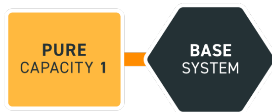
Figure 1. Diagram of system without renewable resources.

The capacity calculated is designated in Figure 1 as Pure Capacity 1.