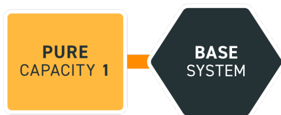
Figure 1. Diagram of system without renewable resources.

The capacity calculated is designated in Figure 1 as Pure Capacity 1.